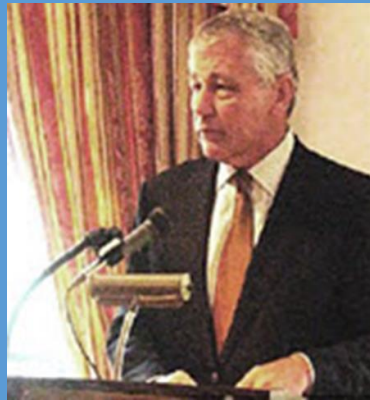
Chuck Hagel, Obama Secretary of Defense Previouslyly Senator (R-Nebraska) Anari Lunch, Army-Navy Club

Under-Secretary of Defense for Industrial Policy Anari Breakfast, Hay Adams Hotel