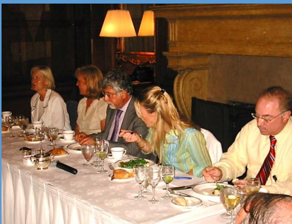
Department of Energy Office Directors ANARI luncheon, Metropolitan Club