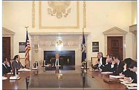
Anari Worldview Washington Delegation Meeting Federal Reserve Board Room

Anari Program Delegates meet with Federal Reserve Board Associate General Counsel & head of the Monetary Policy Division in the old Fed Board Room.