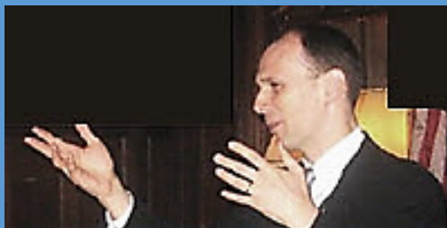
Austin Goolsbee, President Obama's Chairman of Council of Economic Advisors, Metropolitan Club luncheon hosted by Anari Inc.