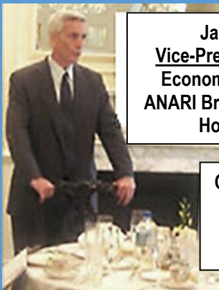
Jared Bernstein Vice-President Biden's Top Economic Aide 2009-2017 ANARI Breakfast - Hay Adams Hotel, Wash. DC

CURRENT: President Biden's Council of Economic Advisors (2021)