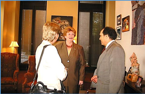
With US Senator Debbie Stabenow (D-Michigan) in her Senate Office

Gallery of former Anari Worldview Washington DC Program meetings