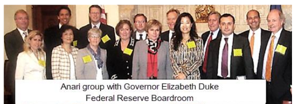
Anari group with Governor Elizabeth Duke Federal Reserve Boardroom