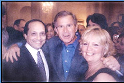
Anari Worldview meeting with President George W. Bush White House 2008

Gallery of former Anari Worldview Washington DC Program meetings