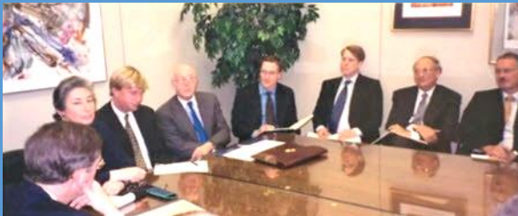
Senator Kent Conrad (far left), (D-North Dakota) In his office in the US Hart Senate Office Building then-Chairman Senate Budget Committee

CURRENT: Chair, Senate Agriculture Committee; and Member, Finance, Budget, Environment and Public Works Committees