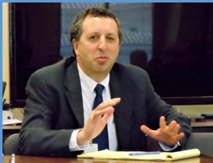
Budget Committee aide to Senator Chuck Schumer (D.-New York)