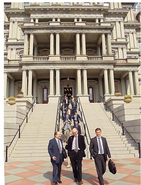
Anari group leaving a meeting at the United States Department of the Treasury