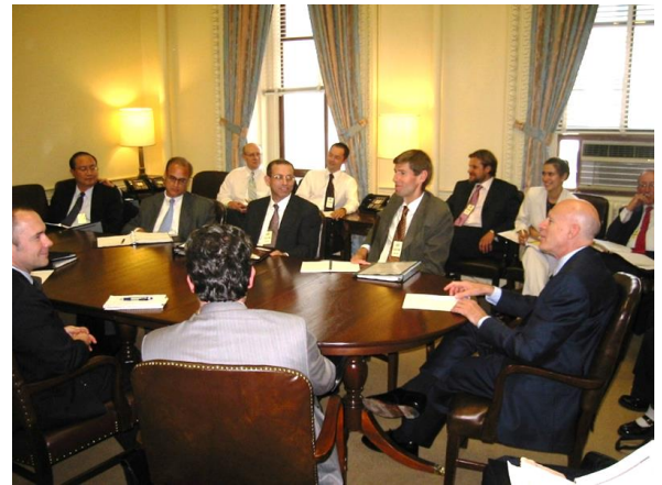
Dr. Ed Lezear, President Bush's Chairman of Council of Economic Advisors Eisenhower Executive Office Building