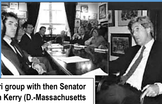
Anari group with then Senator John Kerry (D.-Massachusetts)

Later Presidential Candidate, Secretary of State in President Obama's Administration (2013-2017) CURRENT: President Biden's Special Envoy for Climate (2021)