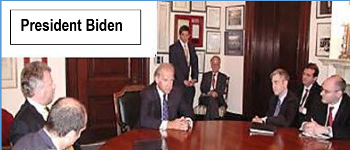
Anari Worldview group with then Senator Biden (D.-Delaware) in his Senate Office Conference Room