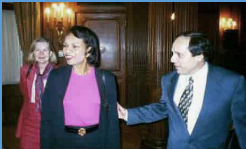
With Secretary of State Condoleezza Rice Cosmos Club 2001